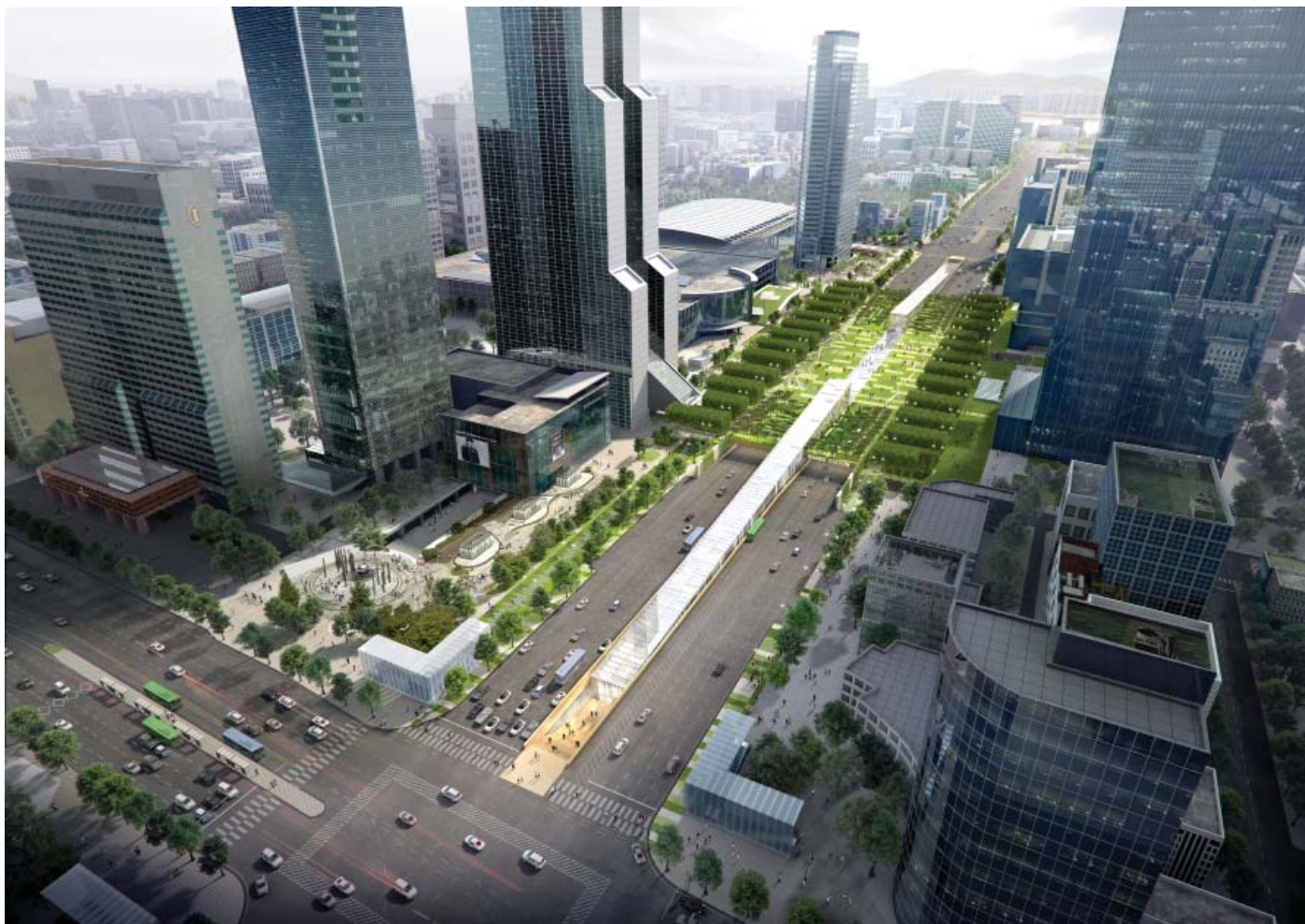
Aerial view of the Gangnam Intermodal Transit Center in Seoul by Dominique Perrault Architecture